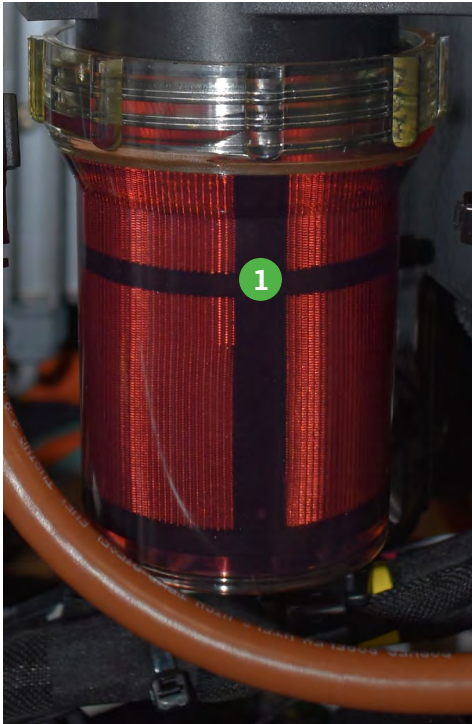
1 NEW: Enhanced Fuel Filtration that supports common-rail fuel injection.